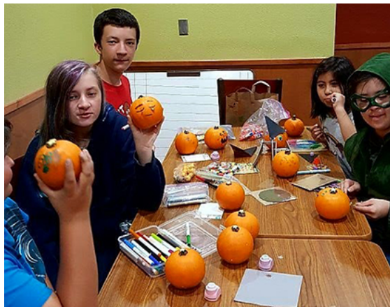
Juniors October pumpkin decorating