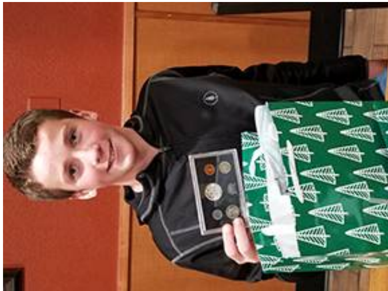
Juniors at the SCCC 2017 Christmas Party